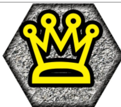
The Vault Hex .

To win the game your thief must- 1) Reach the Vault Hex without being caught by a guard. 2) Reveal your hidden Treasure Card . 3) Reach an Outside Hex on the Map Tile marked with your Exit Thief Card . You must do this while suffering the restrictions of your Treasure and without being caught by a guard. 4) Play a movement Thief Card to move off the Outside Hex on that map tile and get away into the night.