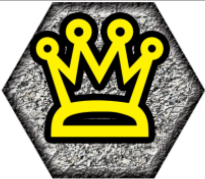
The Vault Hex .

To win the game your thief must- 1) Reach the Vault Hex without being caught by a guard. 2) Reveal your hidden Treasure Card . 3) Reach an Outside Hex on the Map Tile marked with your Exit Thief Card . You must do this while suffering the restrictions of your Treasure and without being caught by a guard. 4) Play a movement Thief Card to move off the Outside Hex on that map tile and get away into the night.