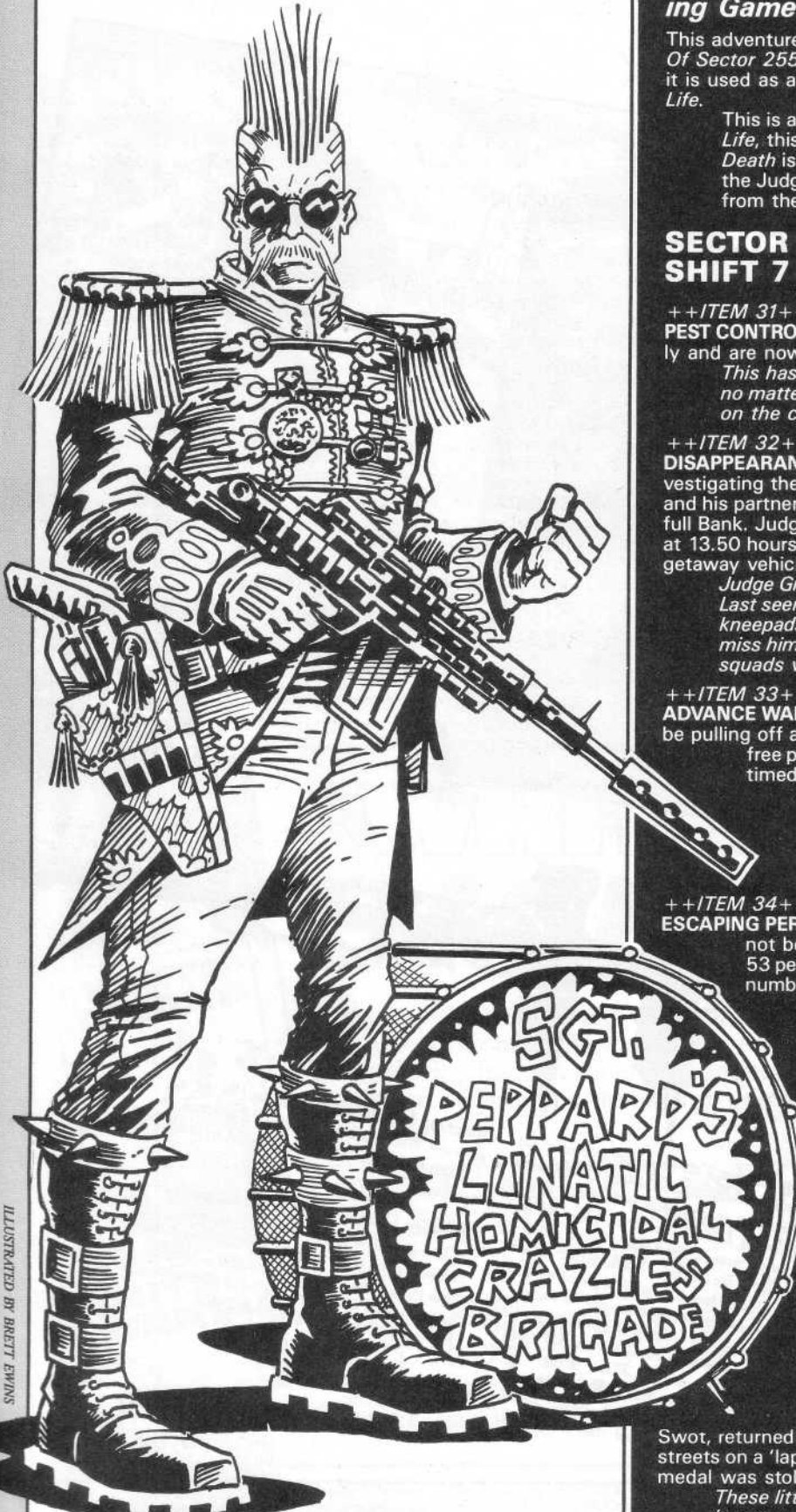
ILLUSTRATED BY BRETT EVANS